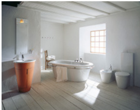
The Axor Starck bathroom from 1994 – the shift away from the conception of the room as merely functional